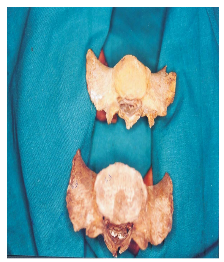
Fig. 3: Male and Female Sacrum showing Transverse diameter of body and ala of 1<sup>st</sup> sacral vertebra

and 101.24 in females] indicates that the sacral width is more in females than males <sup>10-11</sup>,.