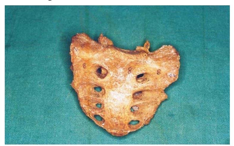
Fig. 1: Female Sacrum short and wider

determined sex of 48 male sacra using vertical length, 13 male sacra from transverse diameter of first sacral vertebra, 12 male sacra from width of sacrum, and 8 male sacra from alar index.